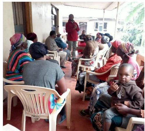
Interaction with local social groups in Kilimanjaro

In four regions of Kilimanjaro, Dodoma, Morogoro, and Dar es Salaam, the project team interacted with local communities during the process of undertaking awareness campaigns through social groups, micro-financial institutions, community-based organizations, e-cook demonstrations, and promotions through trade fairs, public events, and community gatherings. This was performed at the villages of Wari Ndo, Wari Sinde, Foo, Nronga, Boma, Magadini, Moshi Municipality, Mwika, Rombo, Marangu, Chamwino, Kongwa, Kikuyu, Kisasa, Mkuhungu and other areas in Kilimanjaro and Dodoma Municipality. More interactions were conducted at Sinza, Goba, Kimara, Mwenge, Mbezi Beach, Kinondoni, Mikocheni, Mwananyamala and Kijitonyama Wards in Dar es Salaam Region and Kihonda, Msamvu, Sabasaba, Makuyu, Masika, Mazimbu, Mji Mpya, Doma and Town centre at Morogoro Municipality and Mvomero. District.