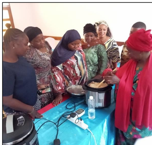
Awareness and Capacity Building to Women Groups

Concerning gender, the project established a link between women's entrepreneurship, economic growth, and empowerment by creating awareness and building capacity to undertake EPC business in the project areas. The project strived to find out and understand the factors that influence the adoption of clean cooking solutions and involve women and girls through various awareness events and social groups. The awareness raising through this project has benefitted women and girls who are users of EPCs in their households. Women also through their MFIs, FBOs, and CBOs were engaged in the activities of delivering EPCs to other members of the community, including providing capacity building and business development in their areas through use and undertaking EPCs business as sales agents and saving time for other economic activities.