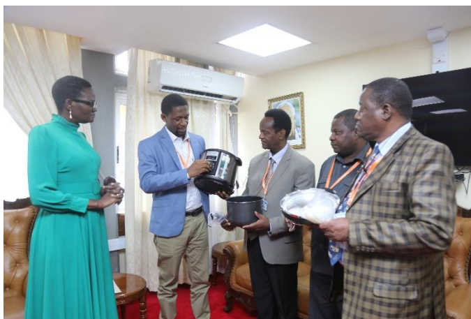
Project Staff explaining EPC to the Speaker of the Parliament of Tanzania during the Advocacy Meeting in her office, Dodoma.

Although it was not the focus of this project to perform advocacy activities for the Parliamentarians, TaTEDO -SESO considered it necessary to start with decision-makers at the national level to foster the enabling environment and increase awareness of MPs on MECS during the national budget sessions. TaTEDO-SESO worked jointly with a Media Company called Tanzania Support Programme (TSP) to support the logistics of advocacy and awareness interventions in different decision hierarchies of the Government and the Parliament of the United Republic of Tanzania. Therefore, the team from TaTEDO in collaboration with the Tanzania Support Programme (TSP) managed to visit and discuss EPC-supportive environment issues with the Speaker of the Parliament of the United Republic of Tanzania, the Minister for State, the Prime Minister's Office (Policy, Parliamentary Affairs, Labour, Youth, Employment and People with Disability) and Chair of the Parliamentary Committee on Energy and Minerals. The discussions with parliament decision-makers led to the opportunity to undertake a workshop for MPs (on 23 May 2023) which discussed in detail the