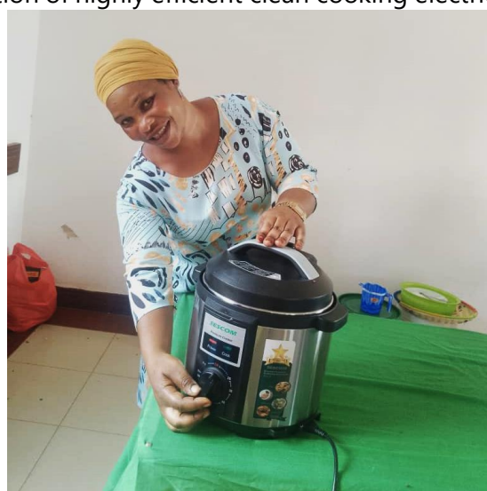
Sales Agent Demonstrating How to Operate EPC in Morogoro

The awareness campaign component was undertaken concurrently with another component of influencing decision-making at the national level which was implemented in Dodoma and entailed undertaking advocacy actions. The advocacy actions were conducted through respective workshops with the Members of the Parliament at the Parliament Compounds and government officials from sectoral ministries and agencies in Dodoma. Demonstrations of electric cooking for different stakeholders were undertaken simultaneously during the workshops with government officials and Members of Parliament.