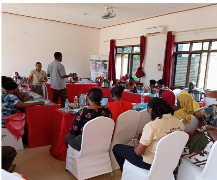
Awareness Creation Workshop for Sales Agents and Social Group Leaders, Morogoro Region

whenever EPC is adopted by a household, it is used for cooking all food, and all other cooking fuels are kept aside unless there is a power blackout or power cut. At the moment we still observe new entrepreneurs coming to the market with different brands The new EPC brands in the market include Up-Energy, West Point, Sayona, Von, Nutricook, Evvoli PMC, Kodtec, Dessine, and Decakila.