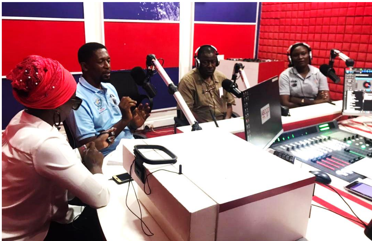
Awareness Creation through Radio Programmes, Abood Radio, Morogoro

The awareness materials (EPC video and TV programs) aired through this project have been uploaded to YouTube through TaTEDO-SESO-TV , and social media ( TaTEDO Facebook , SESCOM Instagram , and Twitter ). Other information is available on the TaTEDO-SESO and SESCO Websites through its blog ( https://tatedo.or.tz/en/medias/blog ). The TaTEDO-SESO TV has been watched by 3,252 viewers.