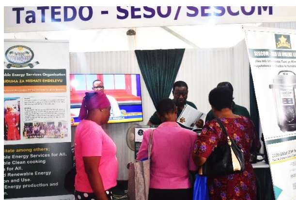
TaTEDO Pavilion during the Dar es Salaam International Trade Fair (Sabasaba Grounds) was used for EPC awareness creation to the public (physically to visitors and through media)

The awareness campaign for electric pressure cookers started with developing a communication and awareness campaign strategy for guiding the promotion of EPCs. This was followed by raising awareness of EPCs to the public through mass media and demonstrations at large gatherings (national events, seminars, workshops, conferences, etc). Demonstrations of EPCs at large gathering places also included trade fairs, marketplaces, village meetings, exhibitions, etc. The physical awareness campaigns were also conducted in the selected urban, peri-urban, and nearby rural areas with the potential demand for EPCs by using social groups, faith-based organizations, micro-financial institutions, and individual sales agents. The sessions of project monitoring were conducted in different areas to assess the outcome and immediate effects of awareness campaigns in those areas.